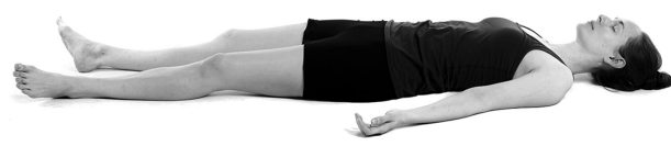
FIGURE 13. Savasana , the corpse pose. Used with permission.

The poses are described on either the right side or the left side, but of course should be done on the opposite side as well. It should take about 30 seconds per side for each of the 12 poses (1 minute per entire pose), thus totaling 12 minutes. The two back bending poses, Salabhasana (the locust pose) and Setu Bandhasana (the