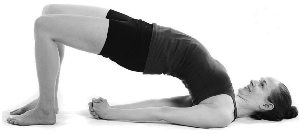
FIGURE 8. Setu Bandhasana , the bridge pose. Used with permission.

(2016) 8-year study. Mean BMD rose significantly for the spine and femur (see Figure 1). Although BMD also rose for the hip, different methods of measure in this calculated value eluded statistical significance.