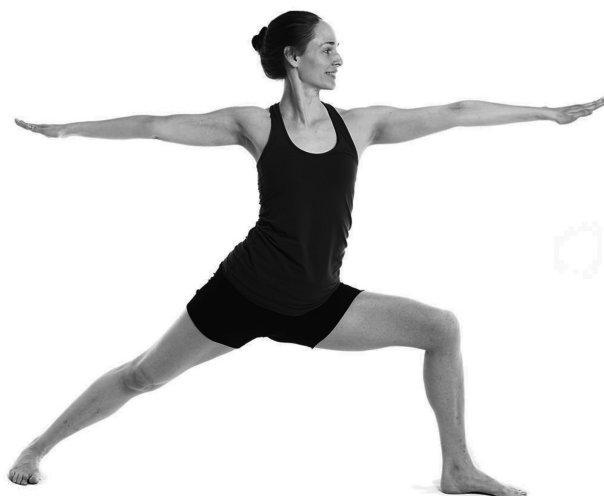
FIGURE 5. Virabhadrasana II , the warrior II pose. Used with permission.

A DVD was provided with directions for three versions of each yoga pose, elementary (beginner),