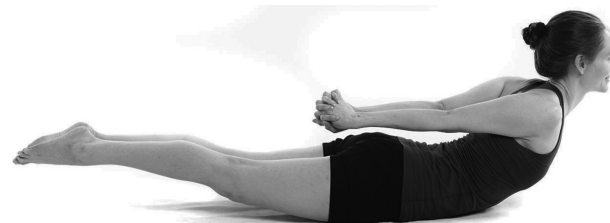
FIGURE 7. Salabhasana , the locust pose. Used with permission.

There were 174 (77%) compliant participants who had osteopenia or osteoporosis at the onset of Lu et al.'s