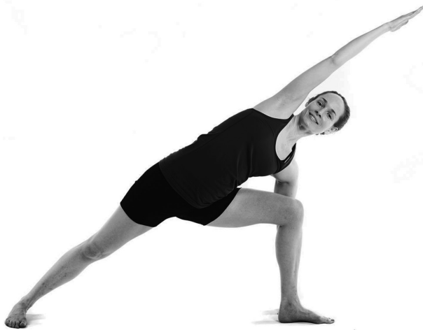
FIGURE 4. Parsvakonasana , the side-angle pose. Used with permission.

relationship between stress on a bone and the bone's support system by generating far greater strain on bones than gravity or standard exercises.