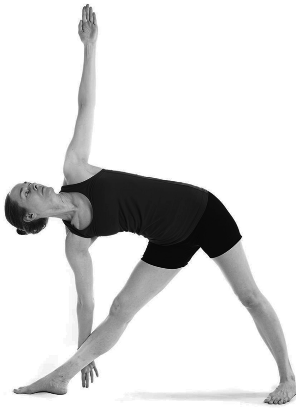
FIGURE 3. Trikonasana , the triangle pose. Used with permission.