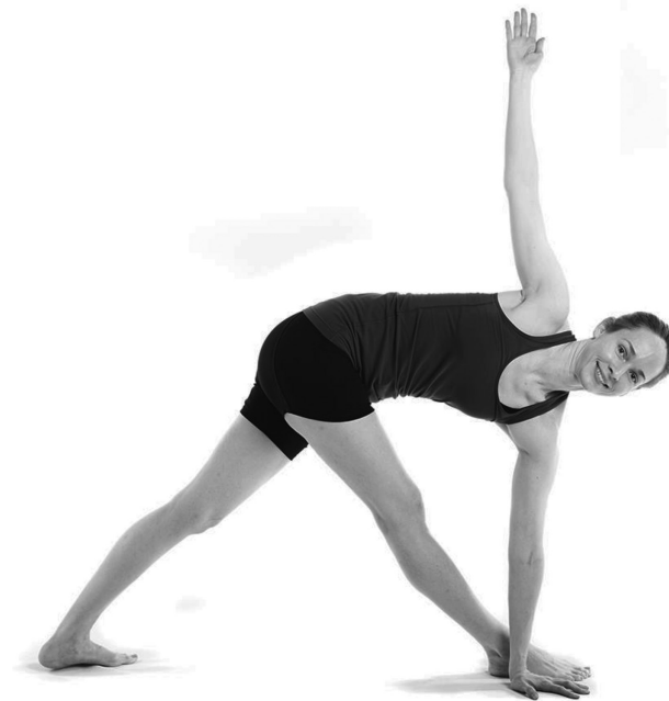
FIGURE 6. Parivrtta Trikonasana , the twisted triangle pose. Used with permission.

intermediate (transitional), and classical (the customarily done full pose) that comprise the Fishman Method of Yoga vs. Osteoporosis . Participants were directed to start with the elementary poses for 1 week, then, based on how safely they could move, to advance to the intermediate, and finally to the classical version. Each pose was to be held for 30 seconds. Those with no yoga experience were to have at least one private lesson from a yoga teacher knowledgeable in Iyengar yoga. The yoga developed by B.K.S. Iyengar stresses steadiness, alignment, and muscular balance (Iyengar, 1962). Poses are held for 30 seconds to several minutes. Yoga activities were logged into an electronic scorecard after being recorded by the participant. Individual participation averaged more than 2 years.