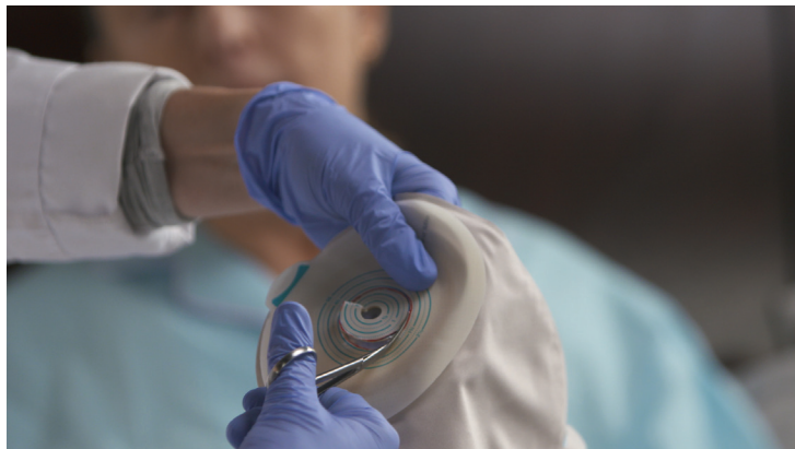
After measuring the stoma using the measuring guide, the nurse cuts the wafer, the adhesive part of the ostomy appliance, which is attached to the skin.

Medication absorption may be altered in people who've had an ileostomy. Some medications, such as those with an enteric coating or in a time-release formulation, may be ineffective because they can't be absorbed. 9 Patients and caregivers need to be aware of this and remind their pharmacist that they've had os-